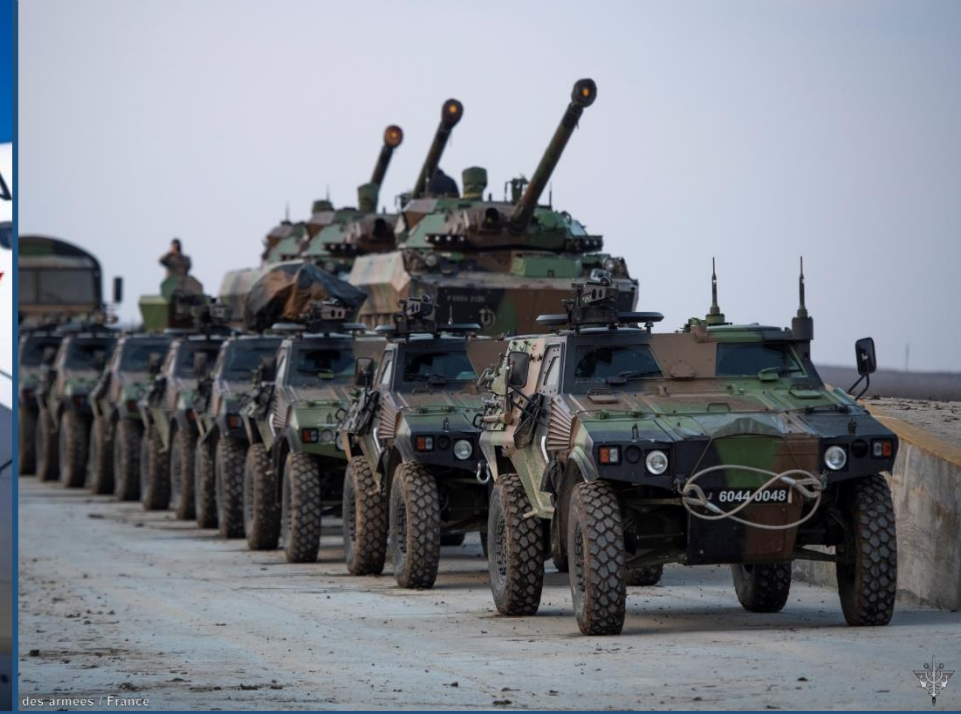
des armées / France

Placed under the command of a Bucharest-based multinational brigade, the Spearhead Battalion has adapted capabilities deployed by France and Belgium. It thus complements the NATO set up already put in place by the Italians, Germans and Americans.